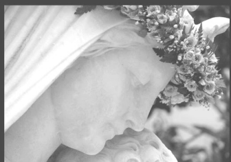
O Mary, we crown thee with flowers today, Queen of the Angels and Queen of the May!